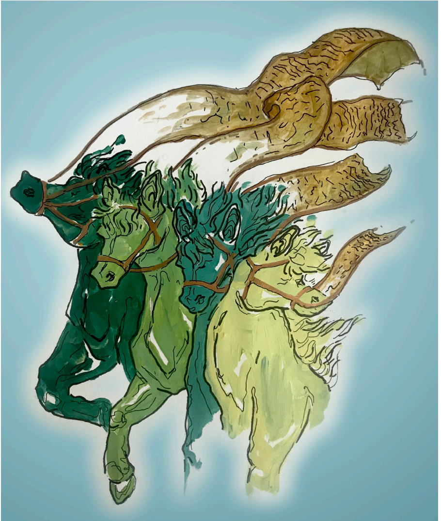
Four Horses. Abigail King.